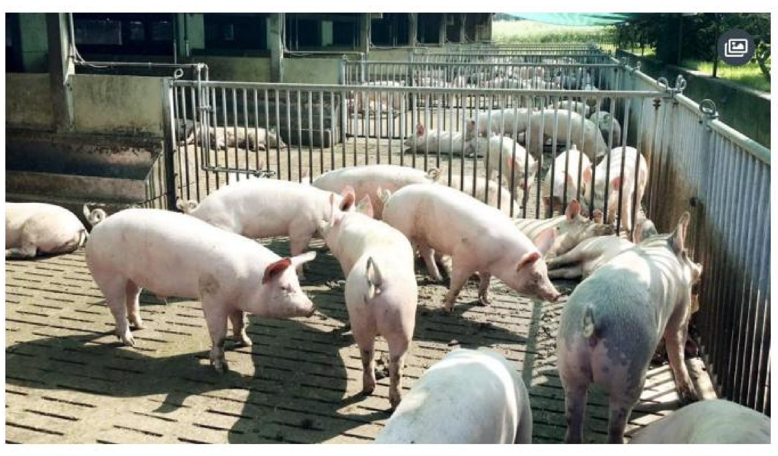
Every year, members of the European Pig Producers gather for a congress, which is held alternately in the various countries. Here, in addition to a number of professional presentations and focus areas, there is also the opportunity to go on company visits and company visits to accompanying companies.

Inspiration, an international insight and not least a network across national borders are just a few of the words that describe the advantages of membership of the association European Pig Producers.